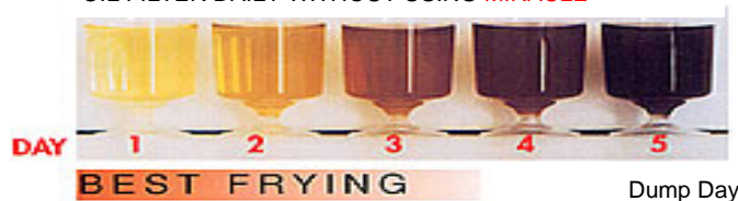
OIL FILTER DAILY WITHOUT USING MIRACLE

MIRACLE FILTER POWDER works by removing food debris and impurities from your fryer oil which are a major cause of oil breakdown. By using MIRACLE FILTER POWDER daily you can increase the life of your oil by up to 60% which means more profit for you! Your oil will stay cleaner day after day and you will serve maximum quality fried food from your clear odour-free fryer oil