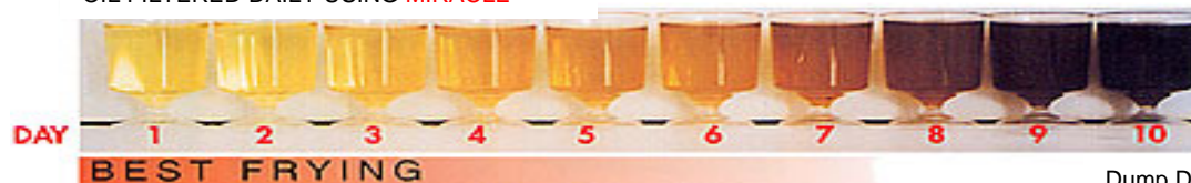
OIL FILTERED DAILY USING MIRACLE